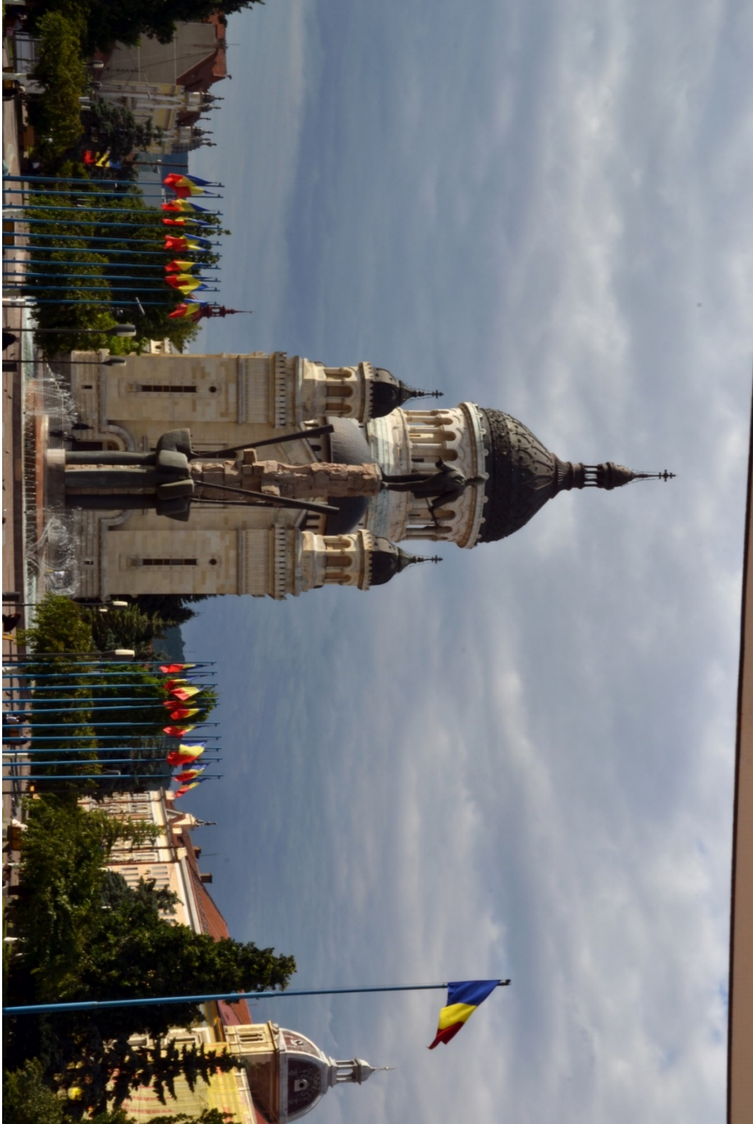
The Orthodox Cathedral