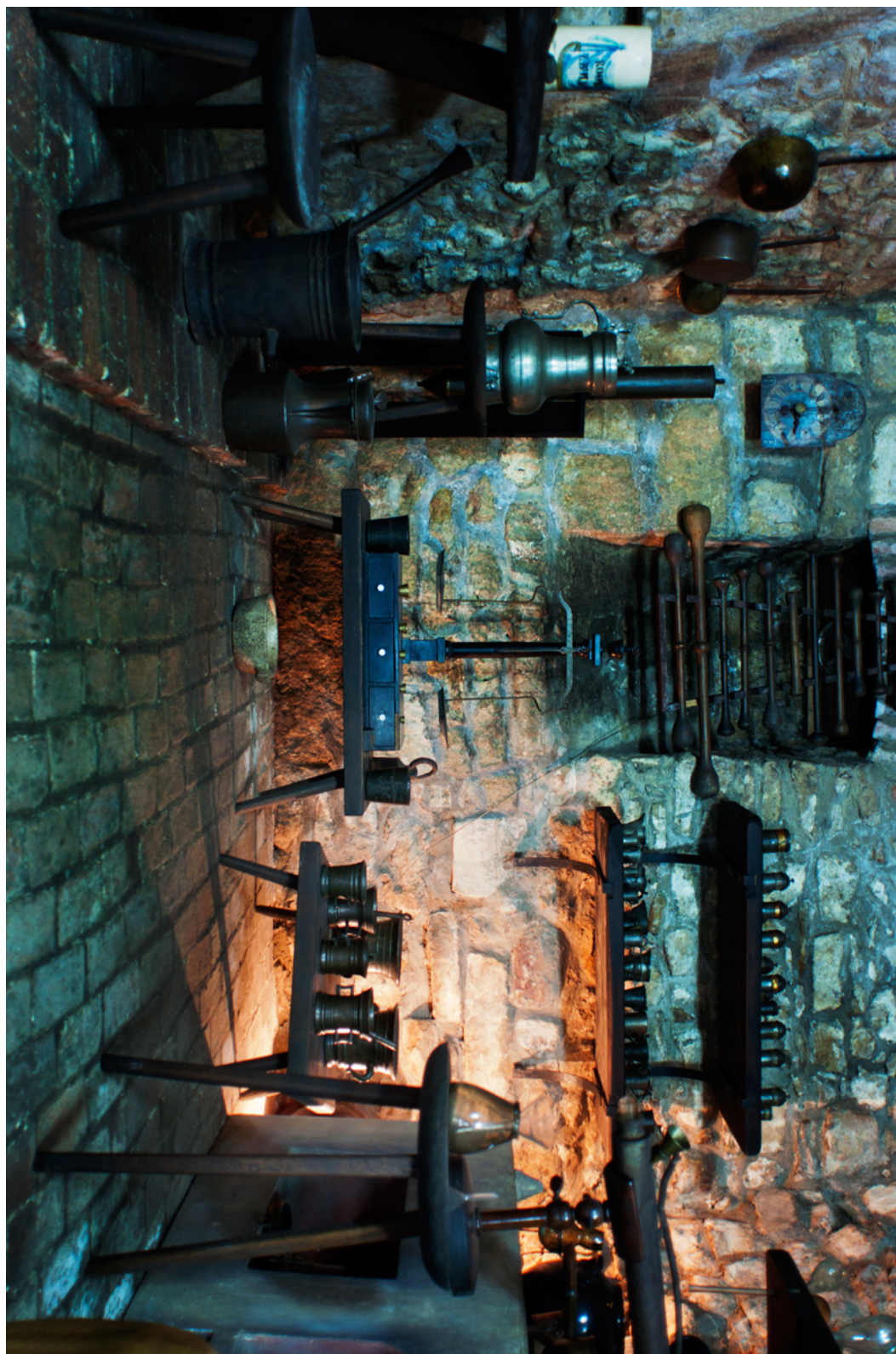
The Pharmacy Museum