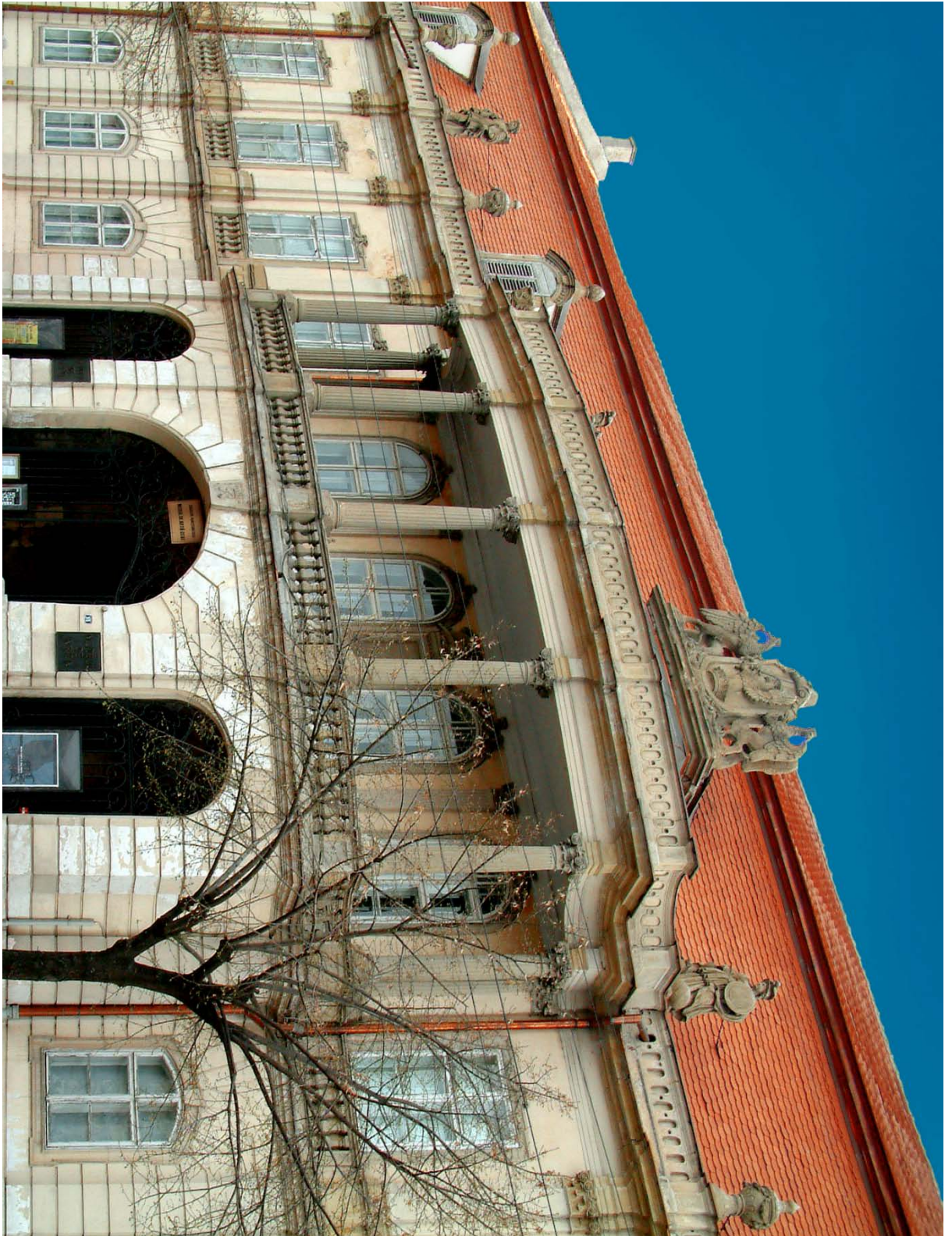
The Bánffy Palace