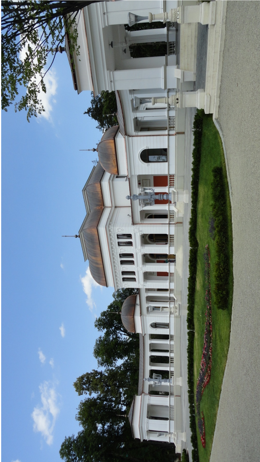
The Casino: The Centre of Urban Culture