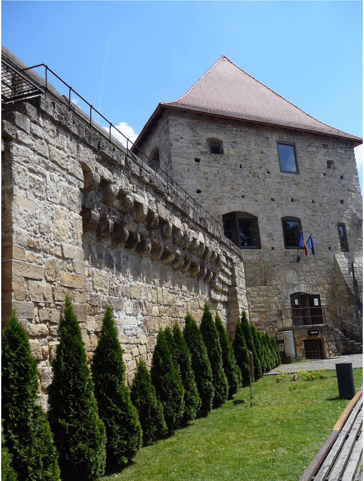
The Tailors' Tower