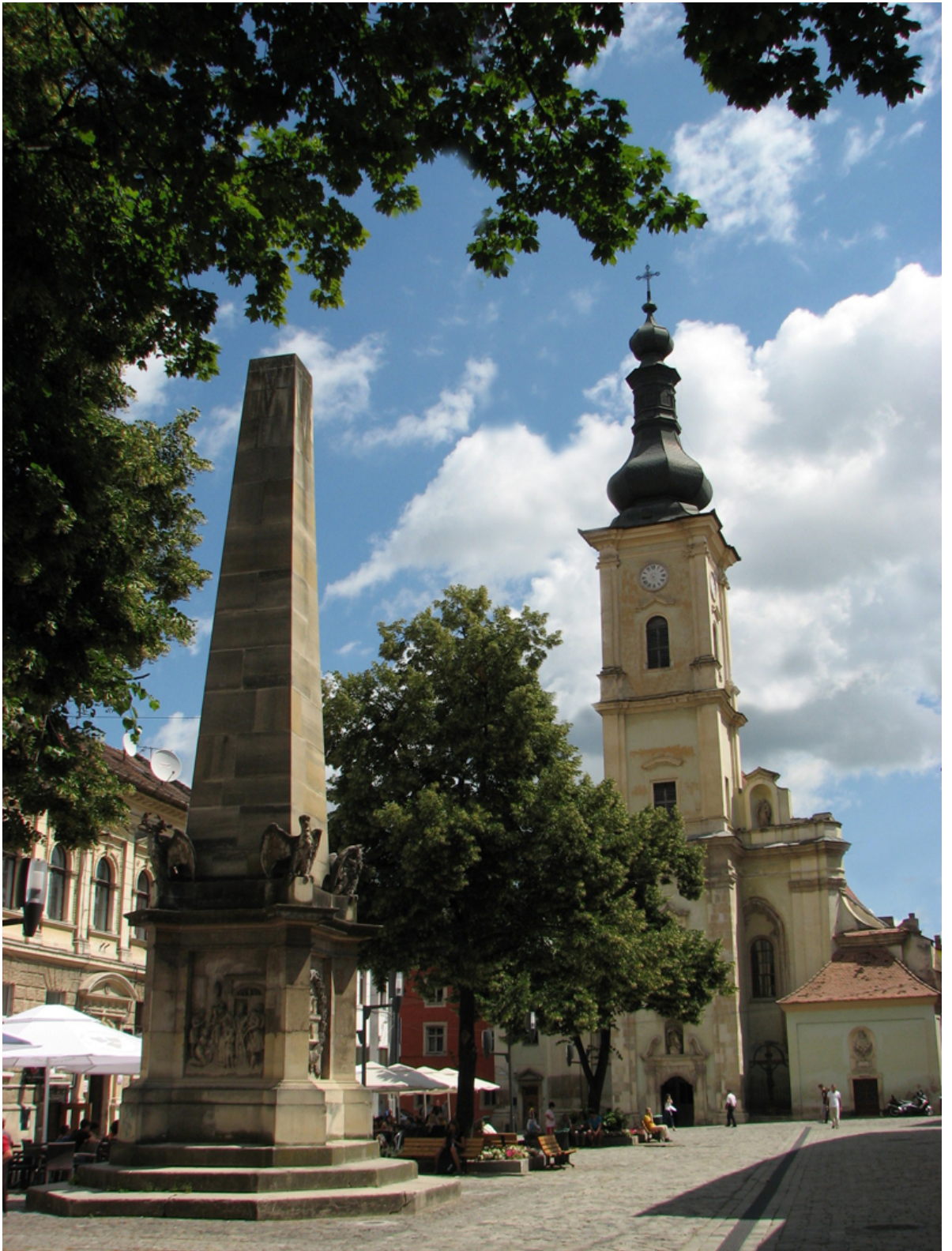
The Museum Square