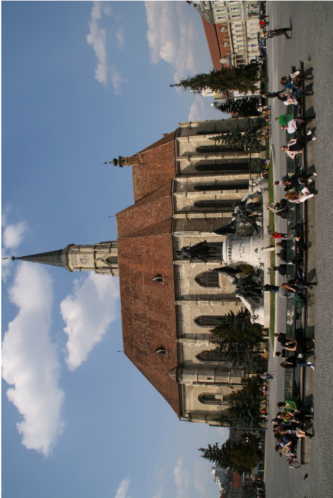
St. Michael's Church and Matia Corvin Statue