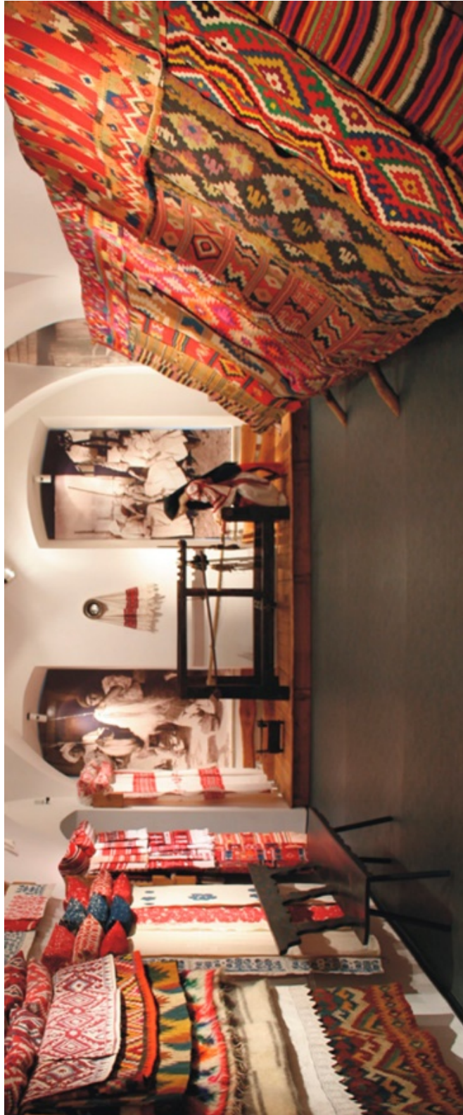
The Ethnographic Museum of Transylvania