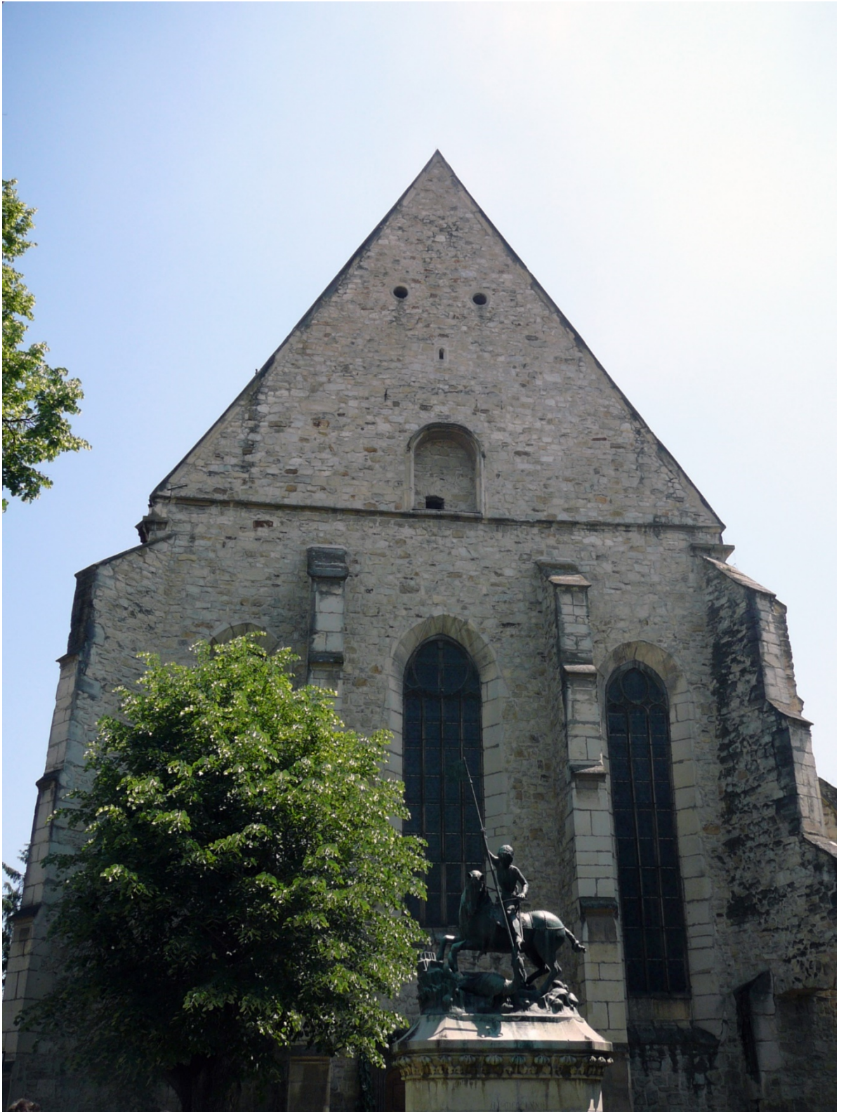
The Reformed Church